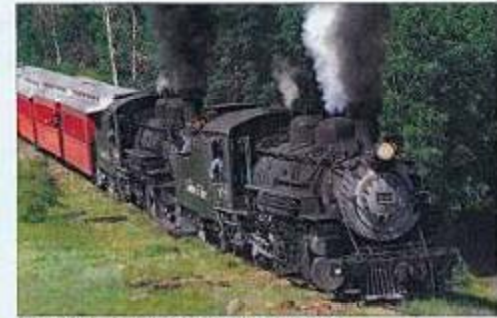
Die Charrler & Lake Lead Railway in Arapahoe County mit typischer hölzerner Schienenbahn. Mit Rauch und Russ durch die Rocky Mountains rattern Eine Nostalgiefahrt von Arapahoe in Colorado nach Chama in New Mexico